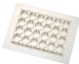
MEA 24well Plate